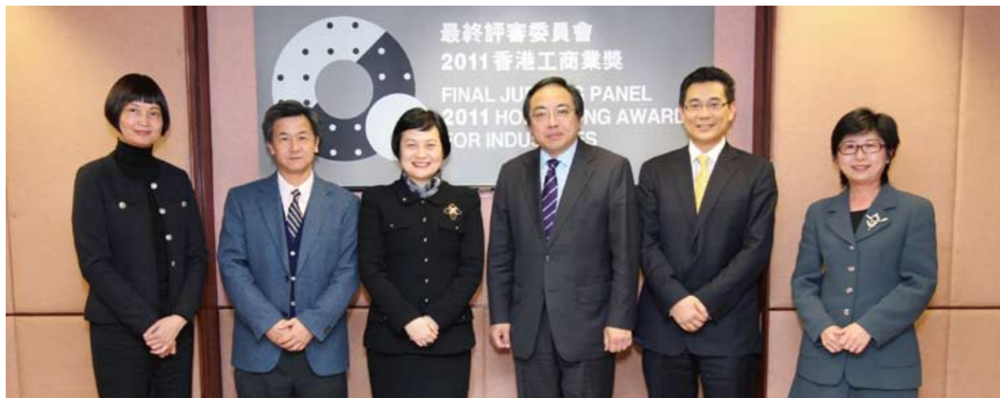
From Left 左起