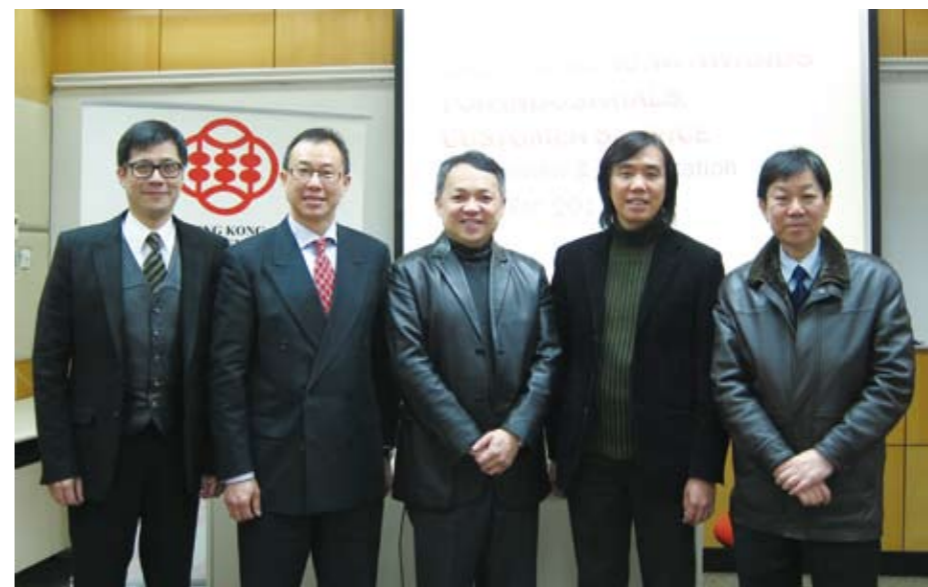
From Left 左起